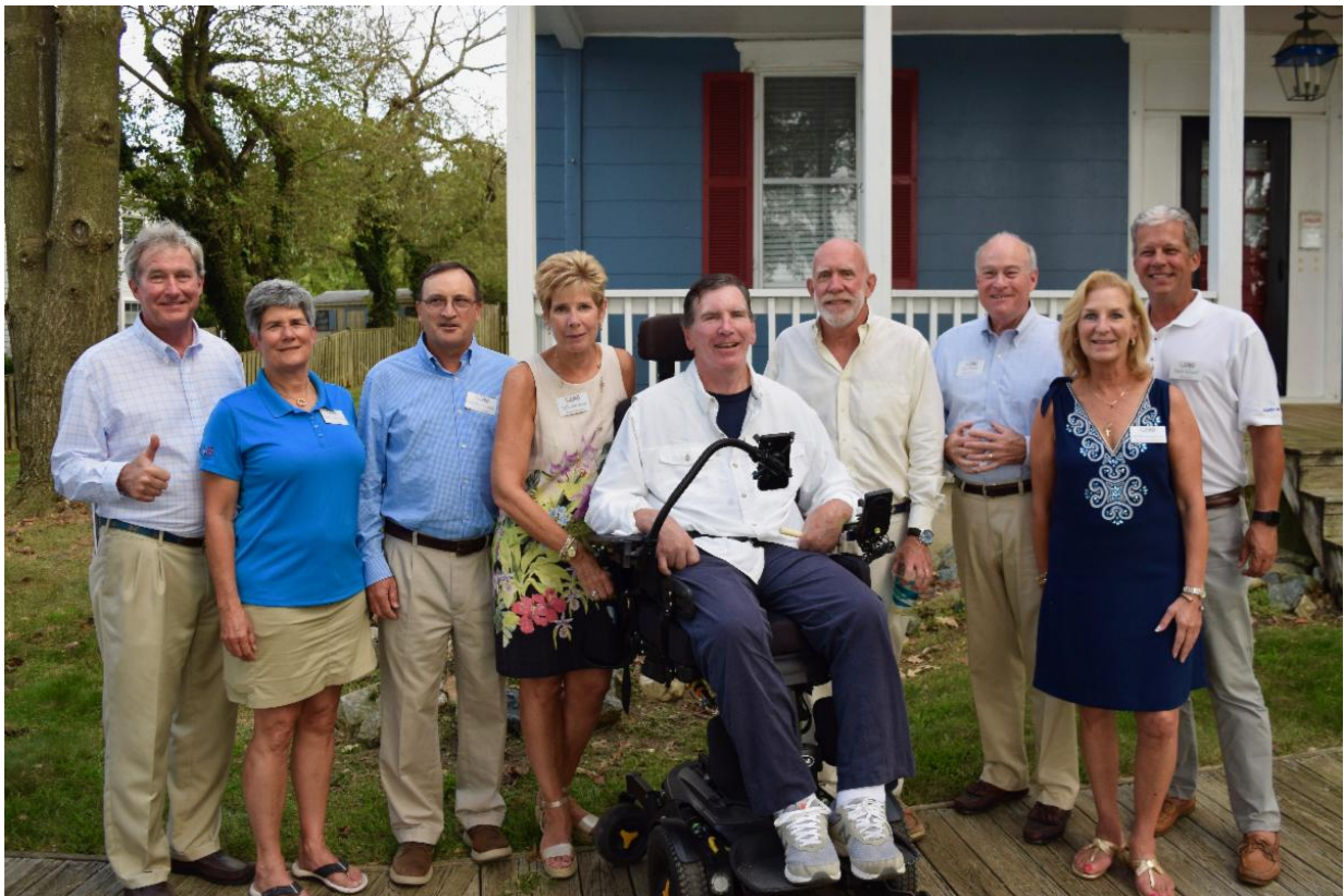
The CRAB Board of Directors flanked by staff at the Marina Naming Reception at the Adaptive Boating Center.

If you have not already started sailing as a volunteer at CRAB there is no better time than now. See you on the water or at the Boat Shows!