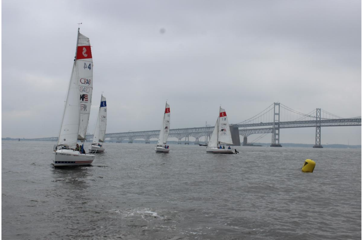
Rounding the mark with a strong current and ebb tide forcing a wide turn