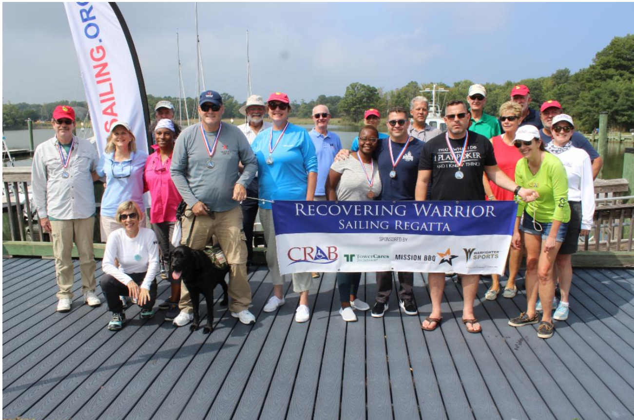
The 18th Recovering Warrior Sailing Regatta