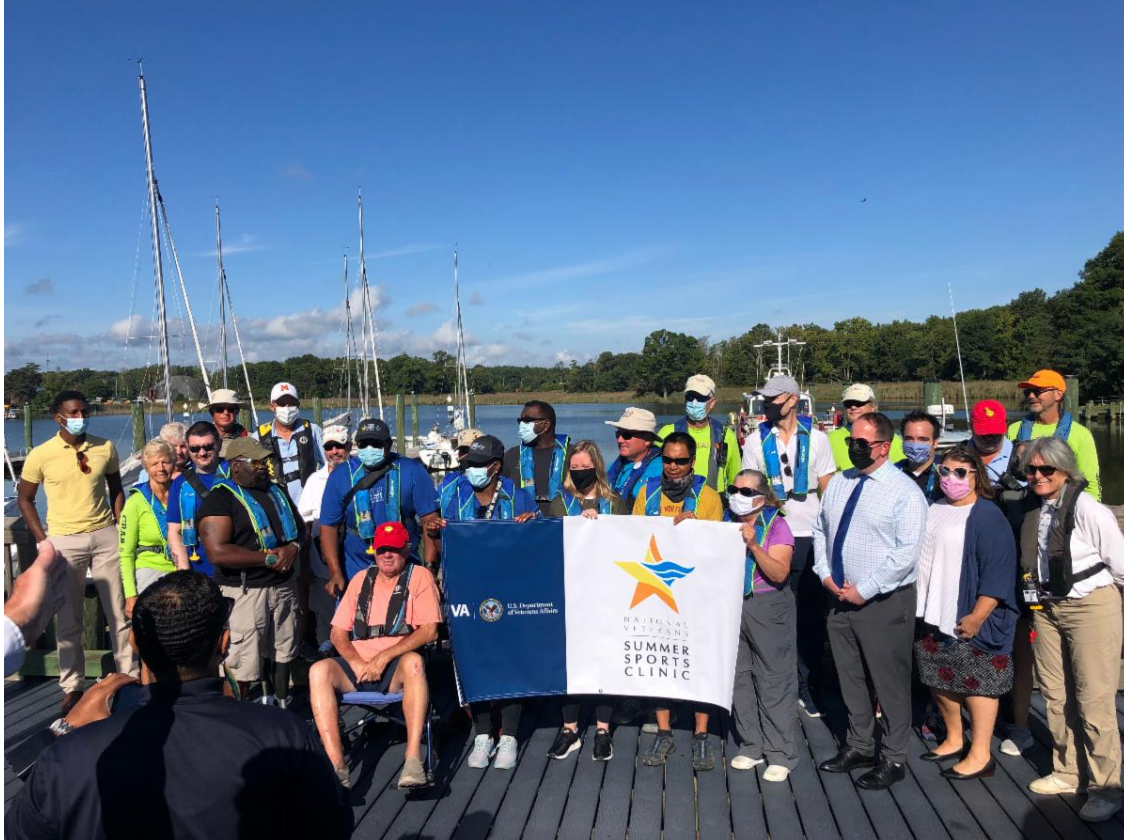
The whole group for the National Veterans Summer Sports Clinic Sailing Day