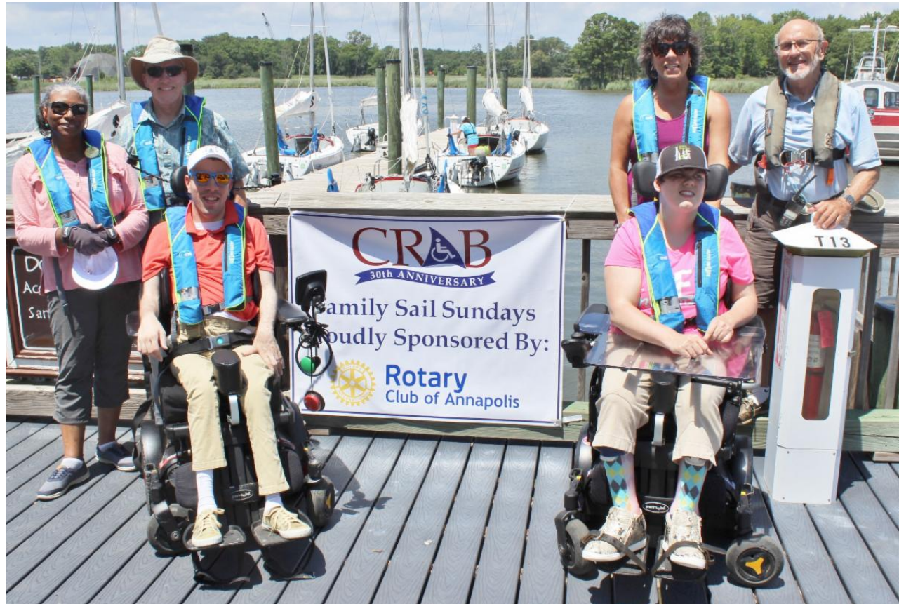
Two families in front of the Rotary Club of Annapolis banner in appreciation for sponsoring CRAB Family Sail Sunday events in 2021