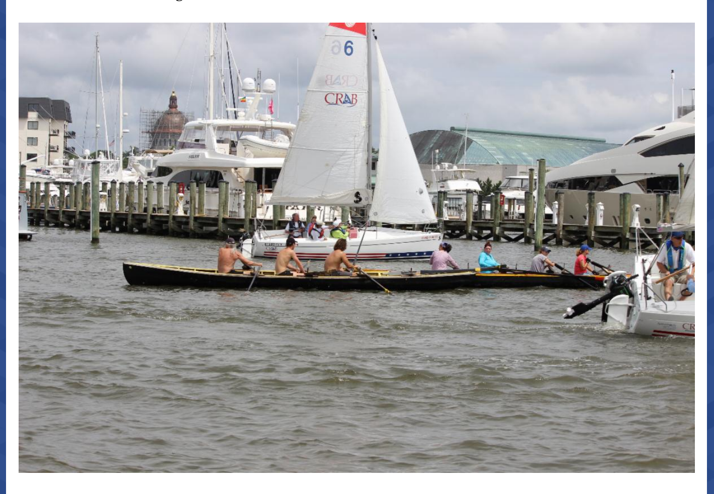
The Don Backe Regatta featured a very congested harbor with a mix of boats coming and going to make it interesting for the CRAB Skippers and AYC tacticians