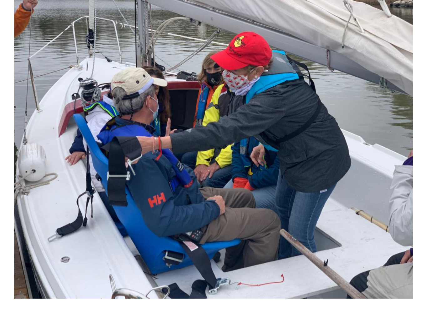
Volunteers practice fastening the 4-point harness seatbelts on each other