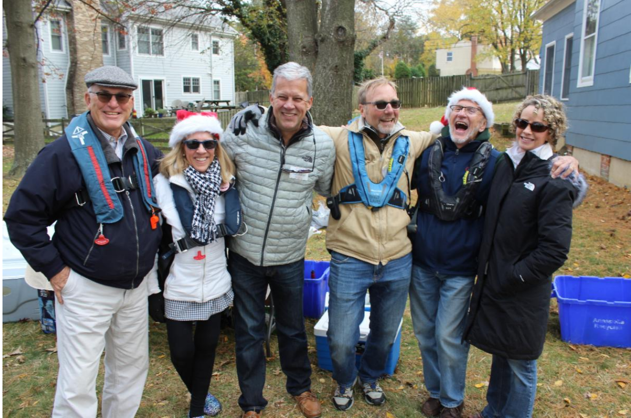
Everyone is getting jolly at the ABC in preparation for the holiday season