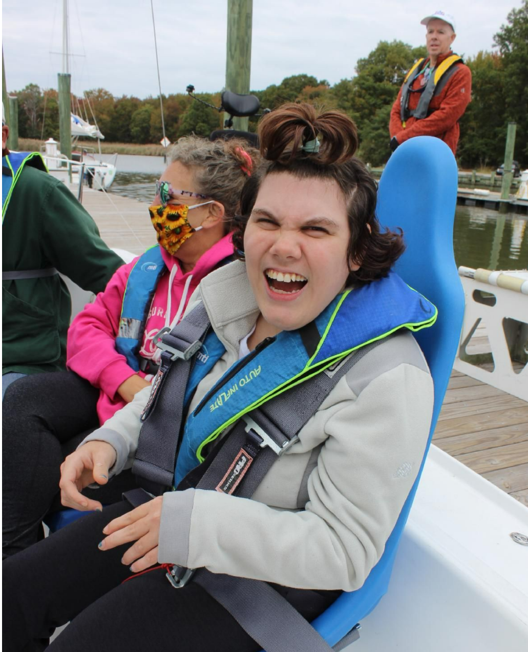
Amber loves sailing with CRAB and she isn't shy about telling everyone!