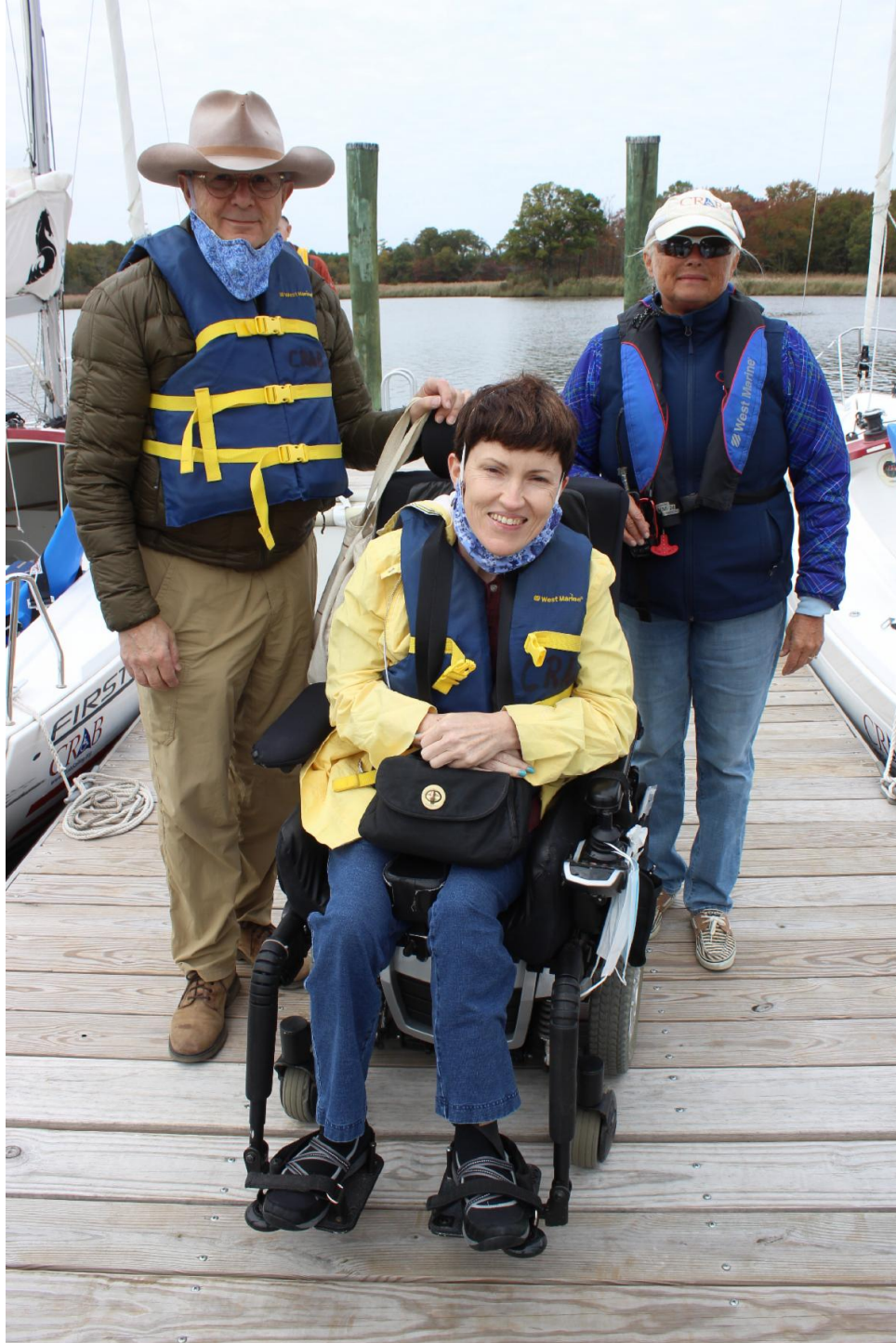
This smile on this guest's face was a prelude to her shouting out "That was fantastic!"