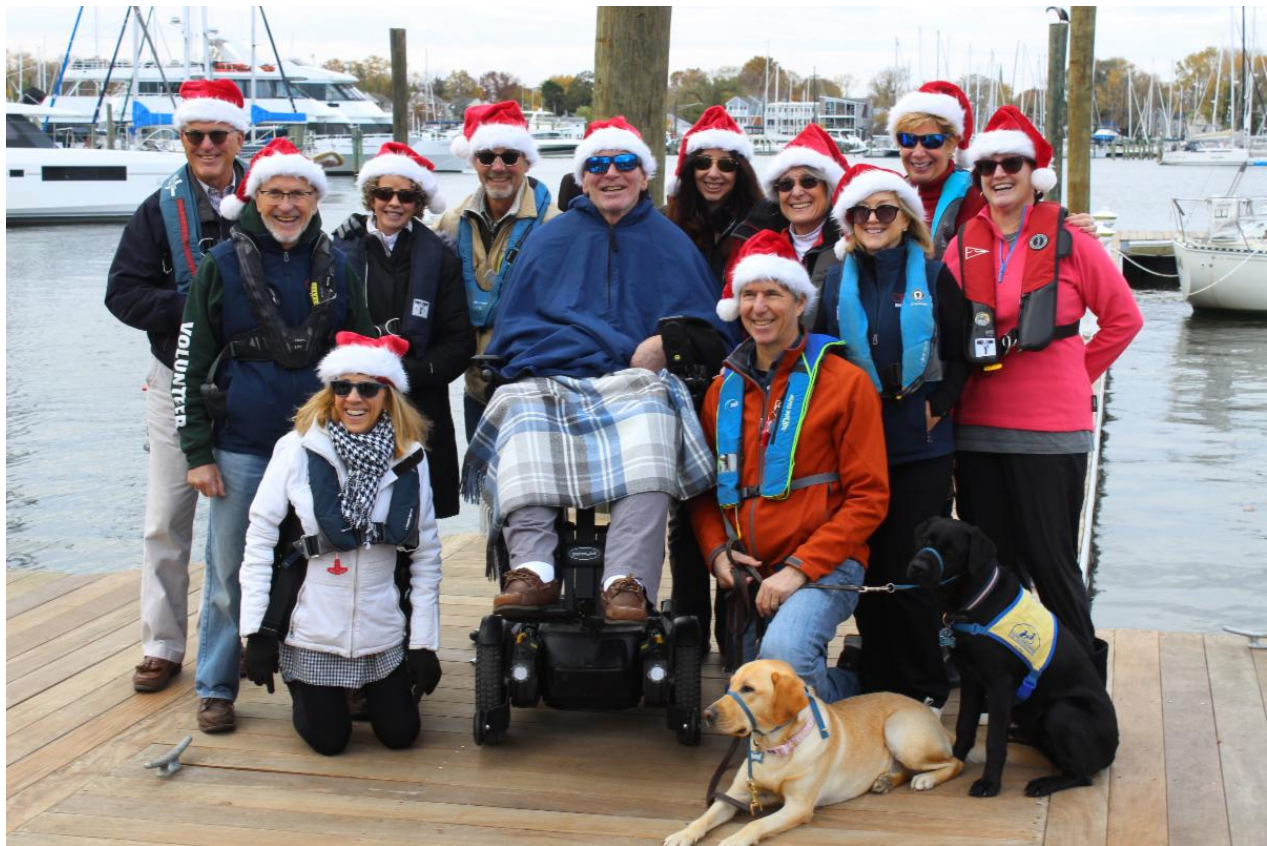
Santa's helpers singing "12 Back Creek Boaters" for the City of Annapolis video