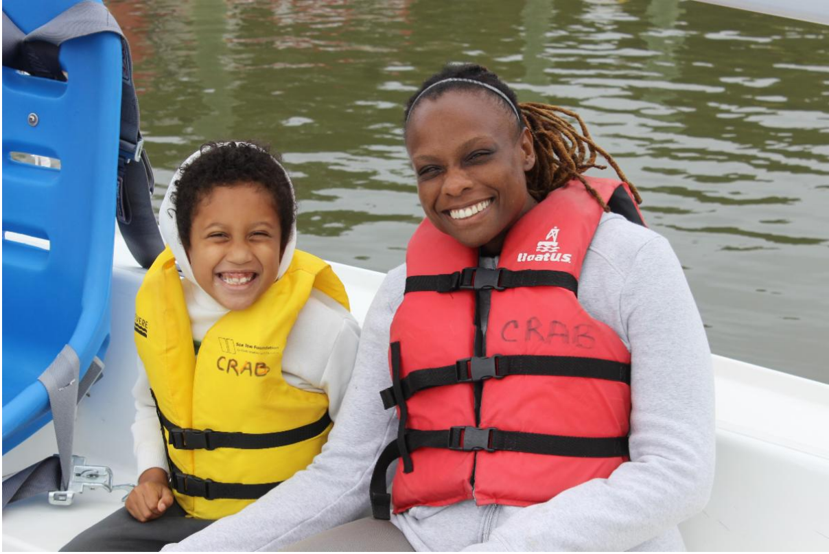
A mom and her son enjoy sailing with CRAB for the first time