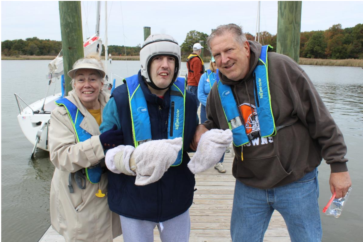
All bundled up, this guest was ready for anything the boom might do