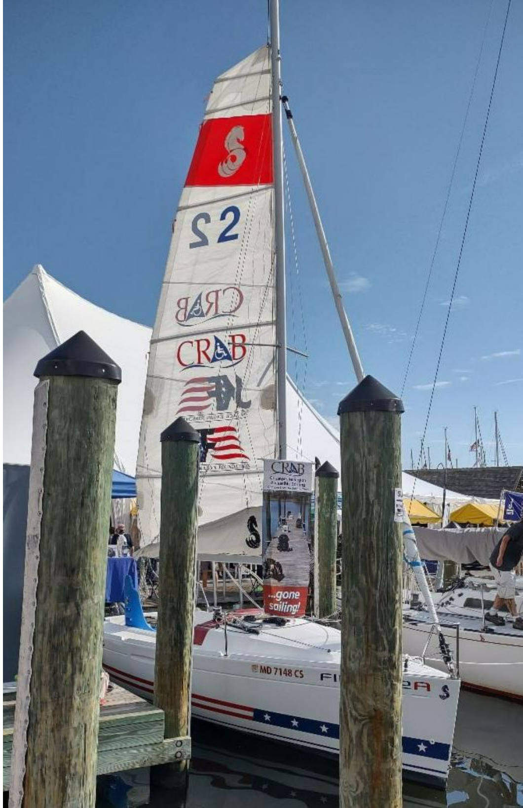
The best boat in the show, "Andrea", on display with the Jack Kagan Foundation logo