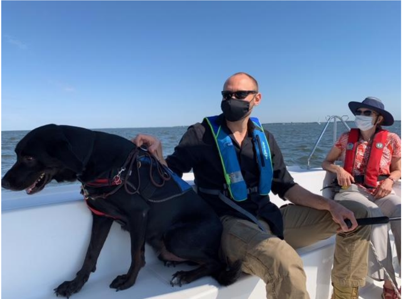
A recovering warrior with his service dog enjoying a wonderful day sailing on the Bay

Bringing Quality to Life One Sail at a Time