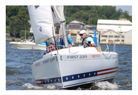
Time to get serious as the wind picked up and the trophy was up for grabs!