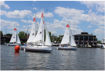
The race is on in front of the Annapolis Yacht Club