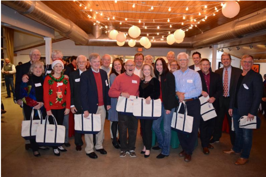
Volunteers with over 25 hours accepting their CRAB canvas sailing bags.

Adding Quality to Life One Sail at a Time