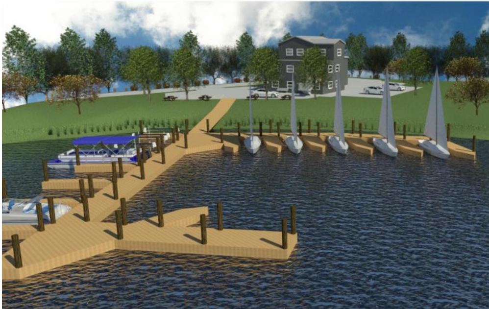
Rendering of the CRAB Annapolis Adaptive Boating Center