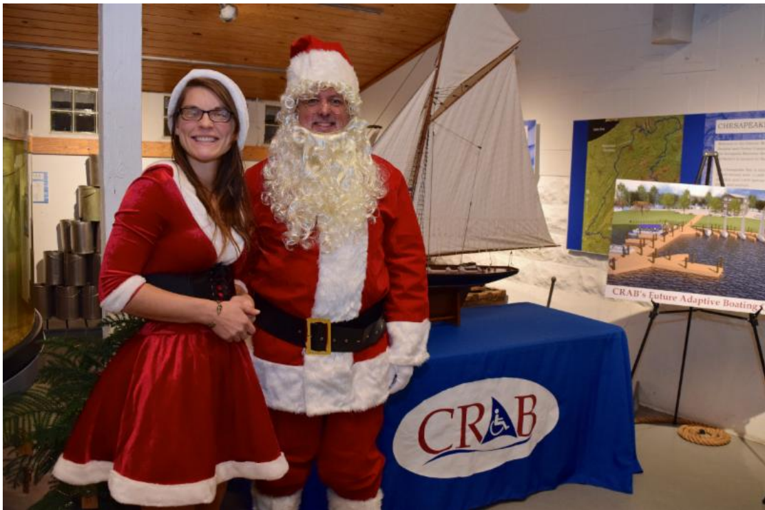
Santa's Helper and Santa greet all of the guests